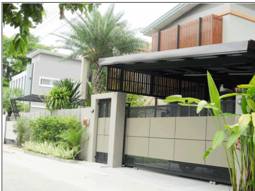
Frontage with personal entry gate and remote controlled garage gate

See OUR You-Tube Video presentation below right but do come back to the website - for a good look arc