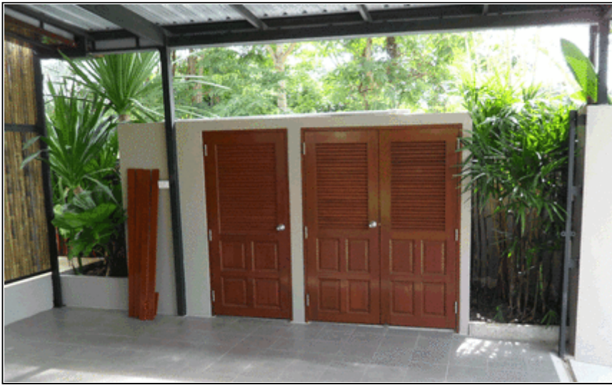
LEFT IS THE POOL PUMP ROOM - AND THE RIGHT IS A HANDY STORE ROOM